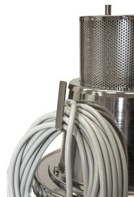
Stainless steel cable holder - included