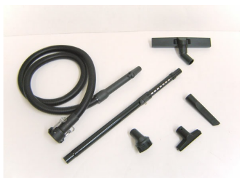
# 323600 - Ø1.25" (Ø32 mm) Standard Tools and Accessories (Kit #1) - Optional