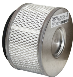
ULPA Filter - Included