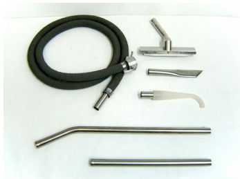
#323604 - Ø1.25" (Ø32 mm) Autoclavable tools and accessories (Kit #3) - Optional