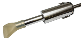
Needle Trap - Optional