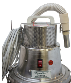
Stainless steel holding bracket - Optional