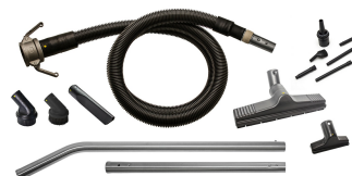
# 323602 - Ø1.25" (Ø32 mm) ESD safe tools and accessories (Kit #2) - Optional