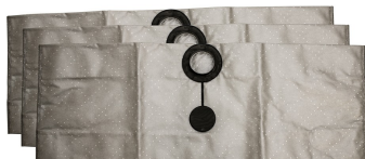
Conductive Recovery Bags - included