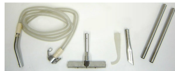
CWR EX Tools and Accessories - Included