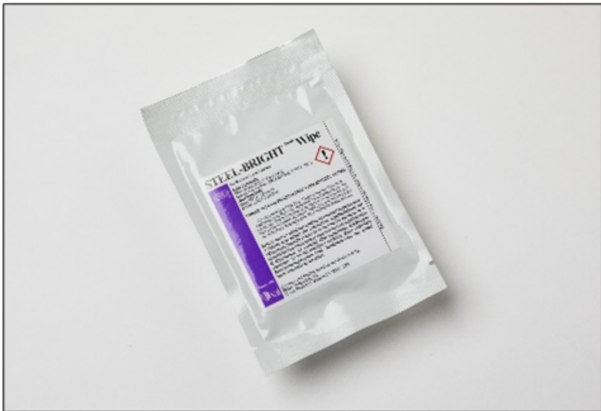
STEEL-BRIGHT WIPE SBW-12X12-S-2315