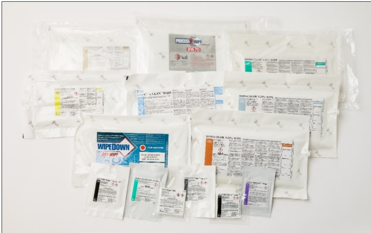
VAI®'s Wiper Family

Veltek Associates, Inc. Disposable Products Manufacturing Division's (DPMD) capabilities include sterile disposable garments, sterile disposable face masks, dry wipers, sterile wipers, custom cleanroom documentation, sterile synthetic writing substrate, and a HEPA filtered cleanroom printer. DPMD has responded and met demands of professionals in the industry since 1985. Our manufacturing capabilities assure that we will be able to meet all requests and fulfill all of our customer's needs. All DPMD products are processed and packaged in cleanroom facilities from beginning to end and subsequently gamma irradiated or aseptically filled in order assure sterility. For more information call 610-644-8335, email sales@sterile.com or visit our website at www.sterile.com . Patents: www.sterile.com/patents