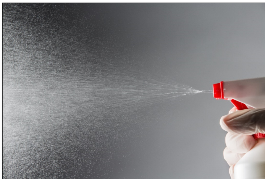
Spraying a HYPO-CHLOR 5.25%, 0.52%, or 0.25% Trigger

Rinsing may be done with sterile water, if needed.