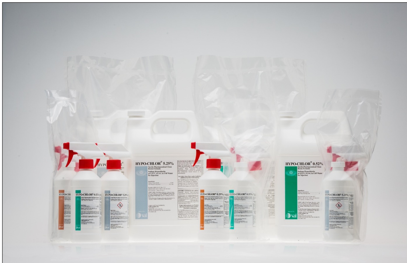
HYPO-CHLOR 0.25%, 0.52%, and 5.25% Family of Products

(Any specific product label is available upon request.)