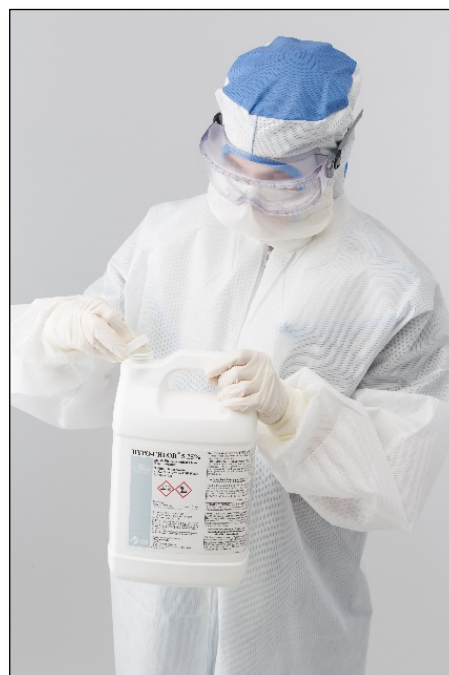
Opening a sterile 1 gallon HYPO-CHLOR 5.25% , SHC-02-5.25